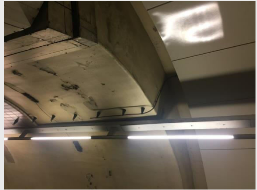
Radio, Leaky feeder cable