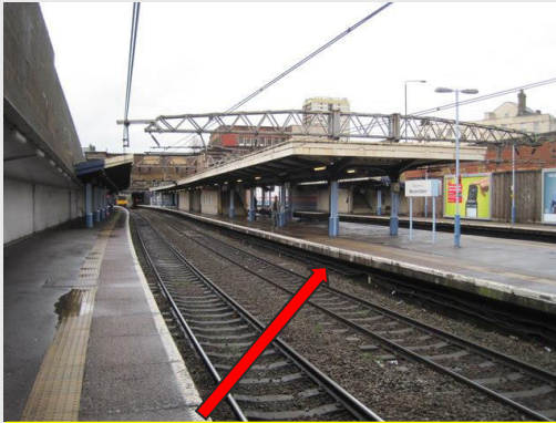
Radio, Leaky feeder cable