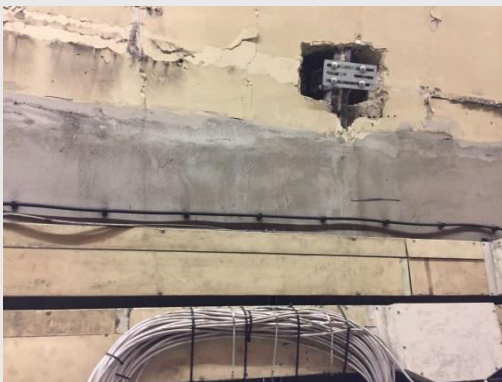
Radio, Leaky feeder cable