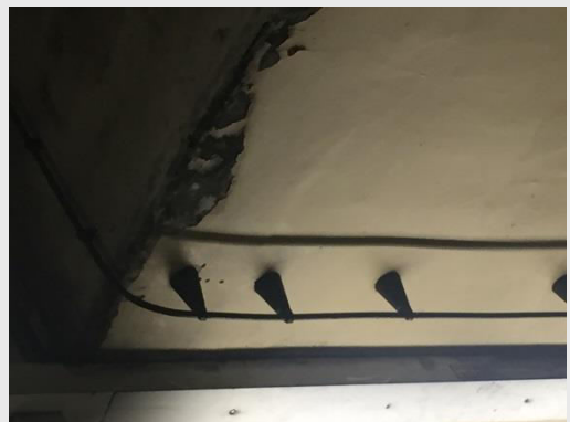
Radio, Leaky feeder cable brackets