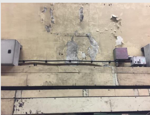
Radio, Leaky feeder cable